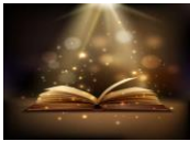
Family and Staff Handbook