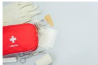
Health and Safety